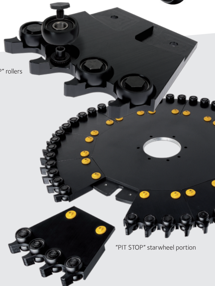
"PIT STOP" starwheel portion