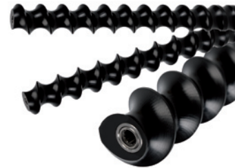
Pharmaceutical infeed screws