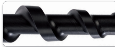
Infeed screw with a low clearance

The clearance between the article and the screw is reduced to the minimum to ensure a maximal stability.