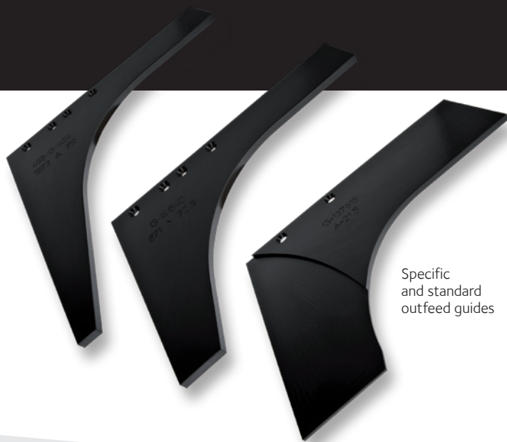
Specific and standard outfeed guides