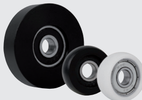
Standard black and white rollers