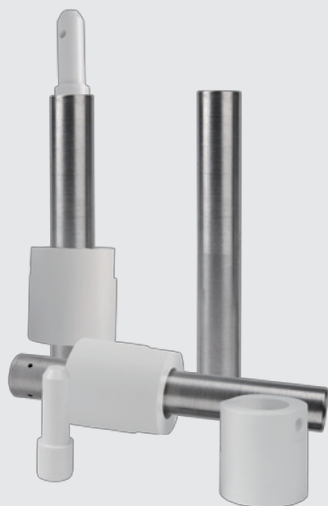
Plug set for bottles