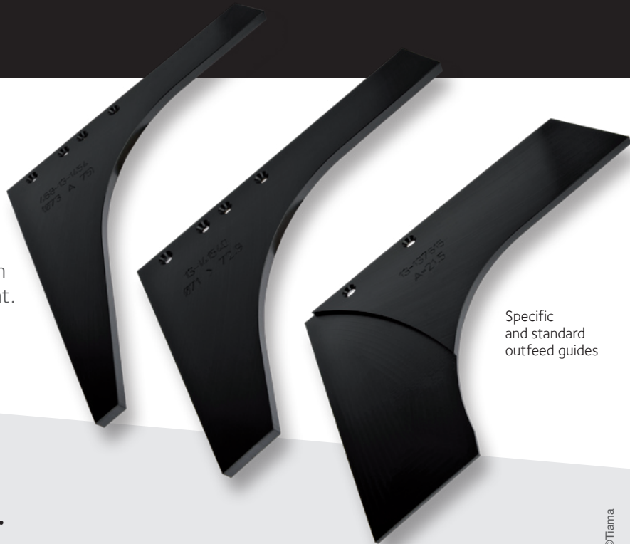
Specific and standard outfeed guides