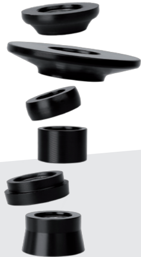
Standard and specific rollers