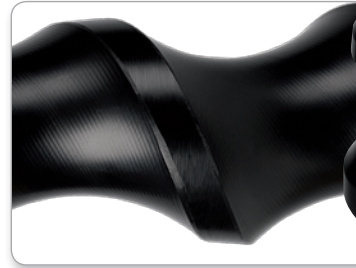
Specific infeed screws adapted to any shape